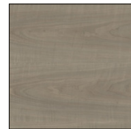
Almond look Ref xx=17