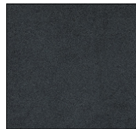
Black caviar look Ref xx=14