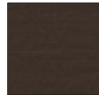
Wenge oak look Ref xx=11